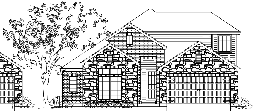
Elevation C with Bonus Room