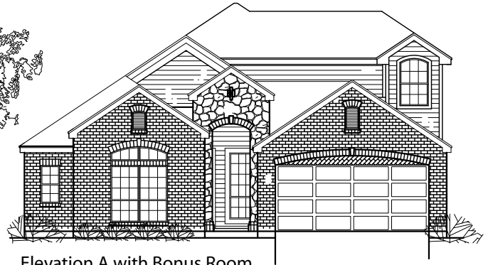
Elevation A with Bonus Room